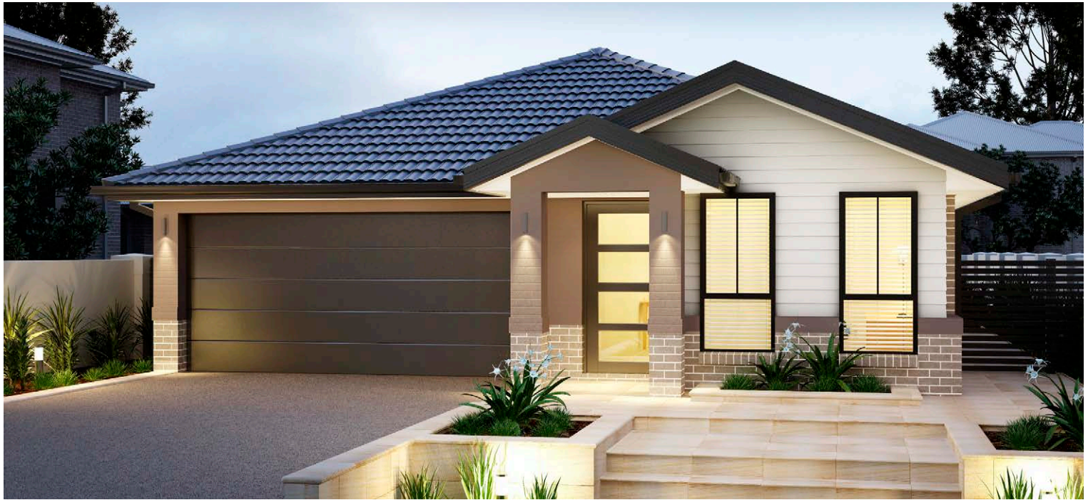
ARTIST IMPRESSION ONLY. NEW TRADITIONAL FAÇADE AS ILLUSTRATED.

FITZROY 27.9 | SUITS BLOCKS UP TO 1M FALL