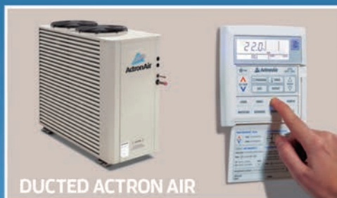
DUCTED ACTRON AIR

All packages come with great quality inclusions