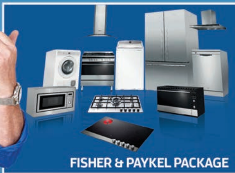
FISHER & PAYKEL PACKAGE