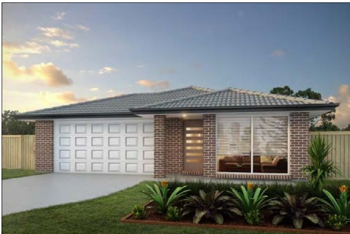
Façade upgrade available as an optional extra