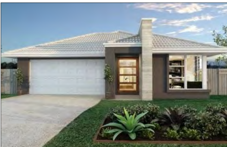
Façade upgrade available as an optional extra