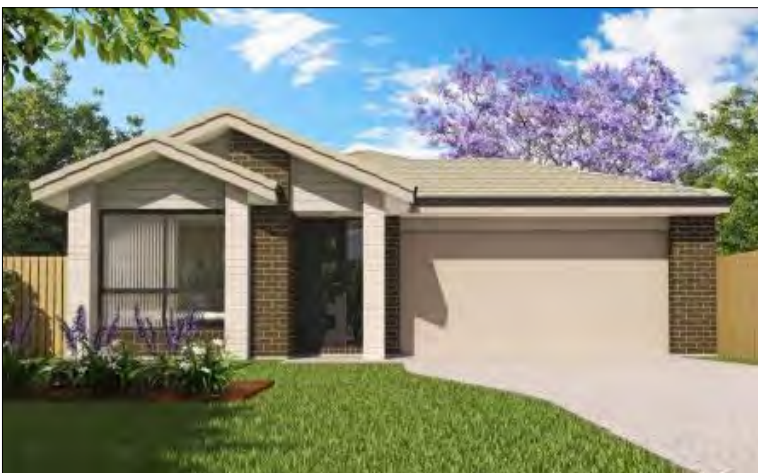
Façade upgrade available as an optional extra