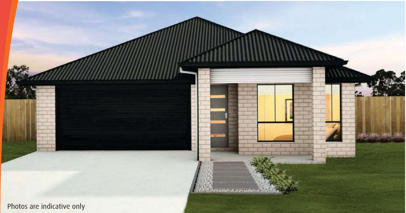
Photos are indicative only

$471,508 | Size of Home 199.8m 2 Lot 122 Newfield Street Rutherford Heritage Parc Estate 592m 2