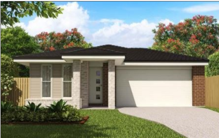
Façade upgrades available as optional extras