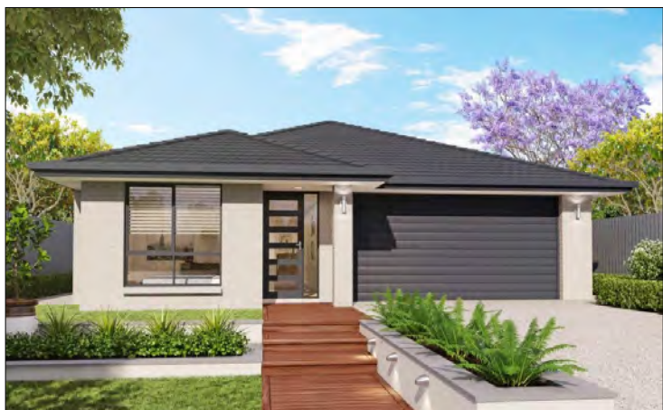
Façade upgrades are available as optional extras